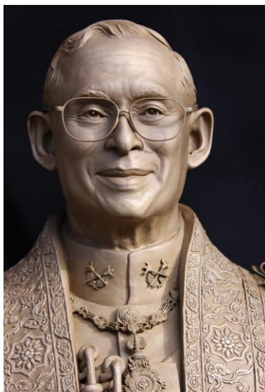
Sunti's bronze bust of King Bhumibol Adulyadej

"I wanted to start in the United States and end in Thailand, just like the king," Sunti said.